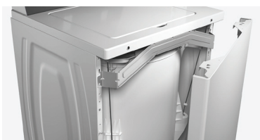
REMOVABLE FRONT PANEL