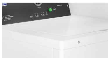
PREMIUM PORCELAIN ENAMEL TOP & LID