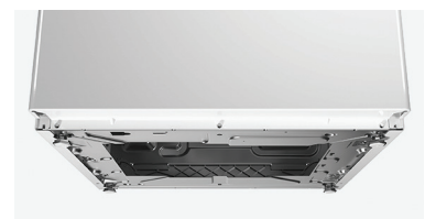
EASY-ACCESS STEEL BASE