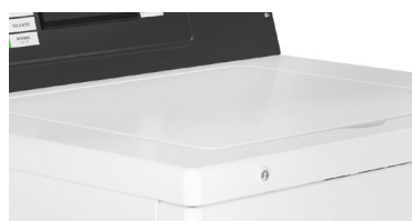
PREMIUM PORCELAIN ENAMEL TOP & LID