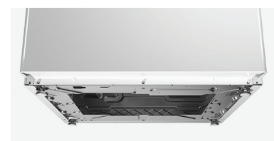
EASY-ACCESS STEEL BASE