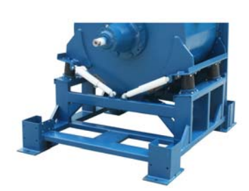
SmoothCoil™ 4 Point Suspension System