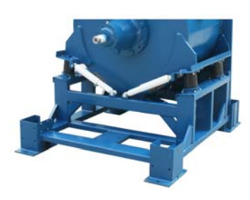
SmoothCoil™ 4 Point Suspension System

Contact Milnor for your local, authorized dealer: