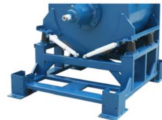
SmoothCoil™ 4 Point Suspension System

Contact Milnor for your local, authorized dealer: