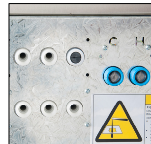
Safe chemical injection