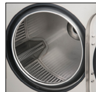
Superior cylinder design