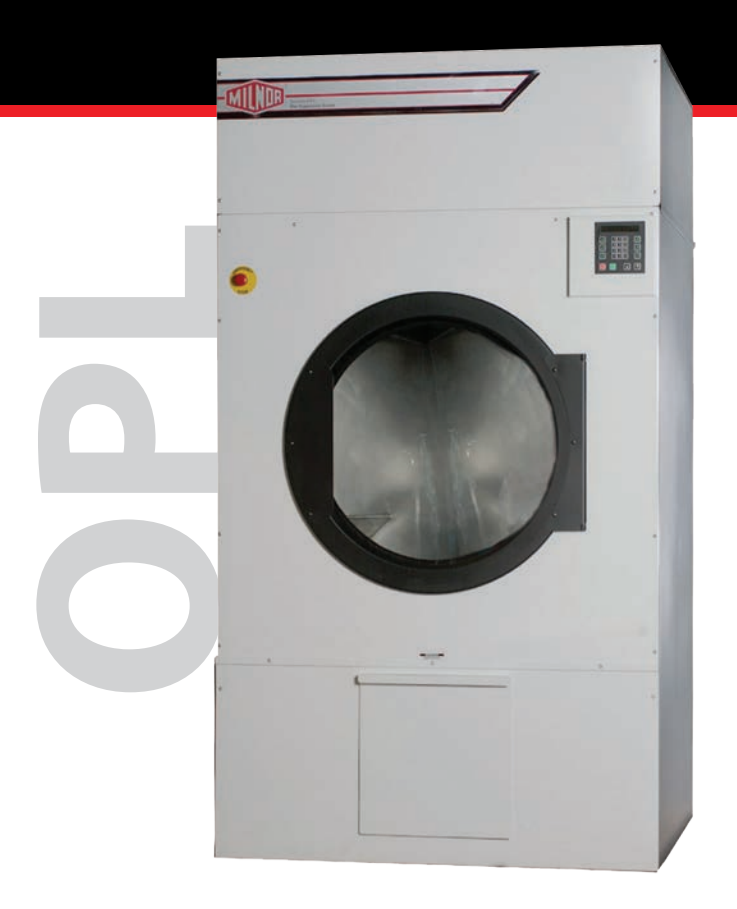
M175 OPL Dryer