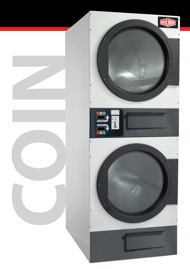
M333C Coin Stack Dryer